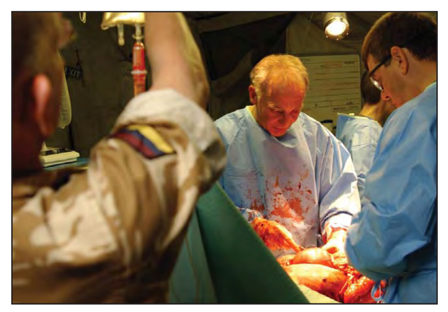
A mass of civilian casualties go through the doors of the 208 Field Hospital in Camp Bastion a suicide bomber had blow himself up in Gereshk injuring many civilians.

Although tracking casualties is not routine to all military forces, it is routine to the British Army, which monitors all the casualties that are treated by its medical personnel in its medical system. This is done for a number of reasons, not least of which is that the use of scarce health care resources and related opportunity costs are a perennial concern to civilian health care managers and Army medical commanders alike. An epidemiological approach to systematically monitor, react and apply capability to where it is most likely required is a well trodden and proven path ever since its first application in 1854. Thus like their civilian counterparts, military health care commanders manage their resources in an evidence-based manner.