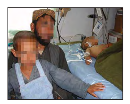
Civilian boys receiving treatment at the British Military Hospital, Camp Bastion, Helmand Province, June 2007.

Calculation and Origin of CBDARS. As in most reports of civilian harm from war, civilian injuries and deaths in Afghanistan have generally been reported as absolute numbers (e.g. 2118 deaths in 2008). Although absolute numbers of casualties are an essential basis of recording civilian harm, these absolute counts are accompanied by little in the way of proportional analysis for patterns. This limits their utility and scope of interpretation. For example, UNAMA reports7: