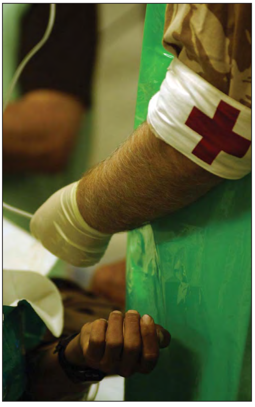
'Hand of hope' as young civilian casualty talks to the military doctors helping him pin point some of his injuries